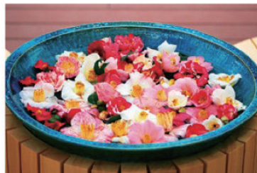
A water pot of colorful camellia