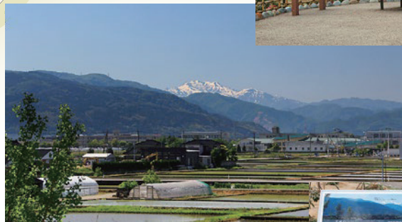
View of Hakusan from the summit "Hakusan View Spot"