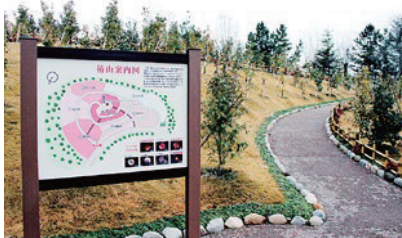
Tsubakiyama guide signboard

There are small manmade hills in the southwest corner of Nonoichi central park. On these, many camellia bloom alongside the garden paths. There are about 200 varieties and about 800 camellias, with both foreign and Japanese species, including the Nonoichi species. Enjoy viewing them all in one place, including on the north slope of TSUBAKI YAMA. Also from the top of the hill, if the weather is good, the sacred Hakusan mountain can be seen. The city has installed Hakusan View Spot signs and benches.