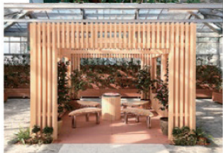
Relaxation space surrounded by camellia