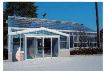
Adjacent camellia cultivation facility