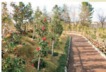
A wide variety of camellia bloom along the in garden path.