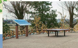
Top of Tsubakiyama