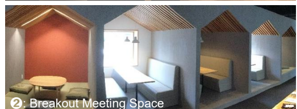
②: Breakout Meeting Space

※Please refer to [IV. Use of Facilities at the KIT International Community House] for the use of common places and equipment.