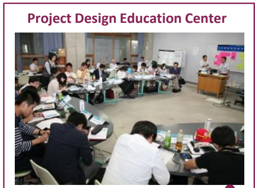
Project Design Education Center