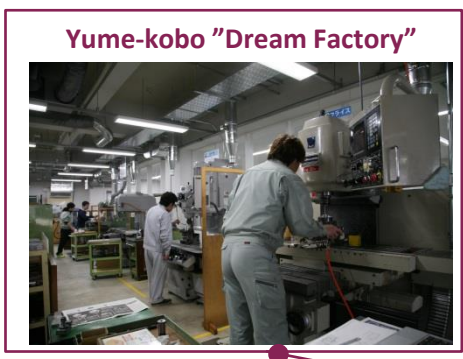
Yume-kobo "Dream Factory"