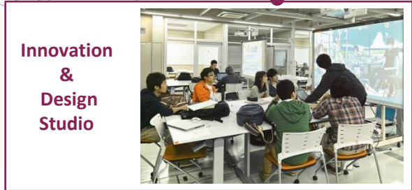
Innovation & Design Studio